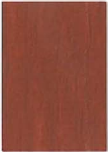
Redwood SW 3501