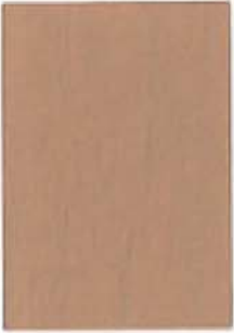
Woodridge SW 3504