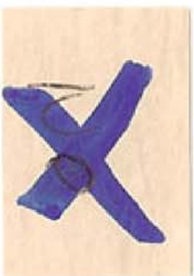
White Birch SW 3503