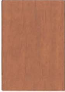
Cider Mill SW 3512