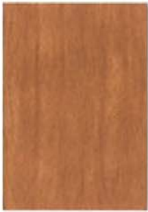
Cedar Bark SW 3511