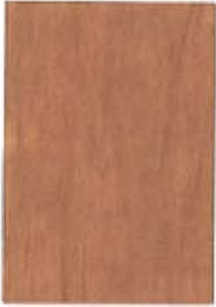
Covered Bridge SW 3508