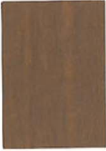
Hawthorne SW 3518