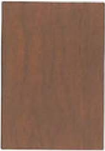
Riverwood SW 3507