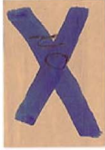
Baja Beige SW 3509