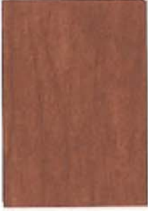
Yankee Barn SW 3505