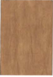
Banyan Brown SW 3522