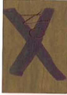
Ficus SW 3520