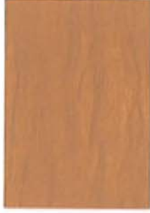
Spice Chest SW 3513