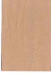
Crossroads SW 3521