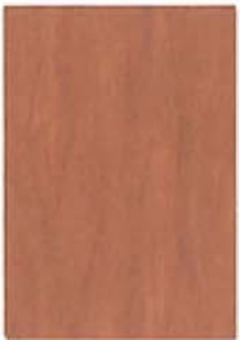
Mission Wall SW 3502